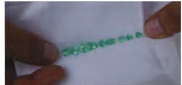
A parcel of Colombian emeralds.

as I was buying a lot each day. On the first day I was informed that I could only change $3000. The next day, I was told that this was not per day, but per month! It turned out that in the 1990's the cocaine cartels were laundering their drug money in the U.S. by buying travelers checks there and then cashing them back home in Colombia. The American DEA influenced the Colombian government to impose this draconian law to "turn off the spigot."