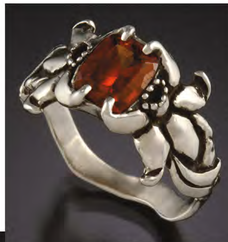
Jonquil Flower & Leaf with Orange Zircon