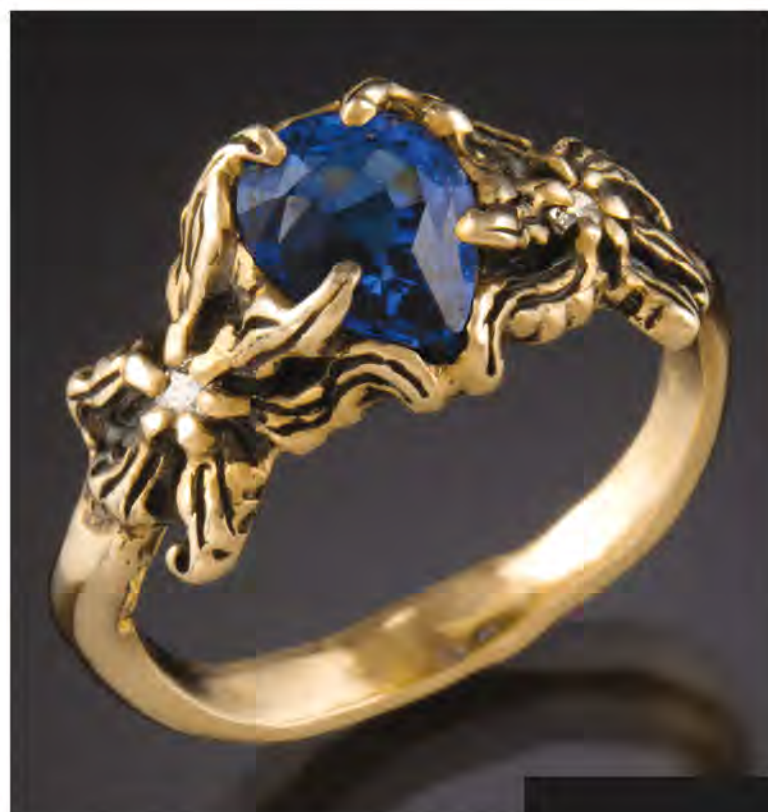
Tiger Lily Flower with Blue Sapphire & Diamonds

And so you have three of my pride and joy!