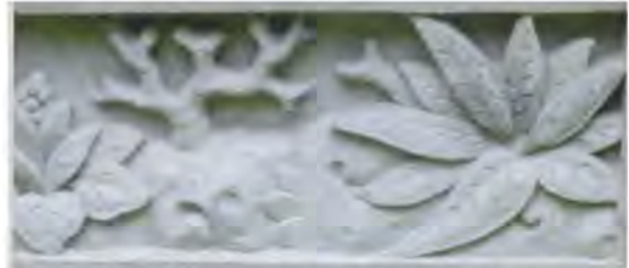
Bas relief panel inspiration for Bamboo Leaf Design.

Near my bungalow in Ubud, I came across a series of large bas relief panels depicting leaves and flowers. One panel in particular displayed a beautiful cluster of leaves and this became the inspiration for my Bamboo Leaf ring.