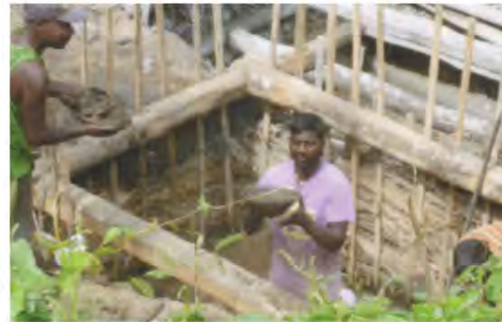
Gem gravels are scooped up one basket at a time..

It was an exciting and successful gem buying trip, All in all, I returned home "stone broke," but with an amazing collection of beautiful gemstones which I look forward to showing to you.