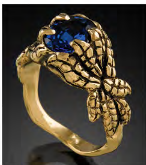
Bamboo Leaves Design with Sapphire