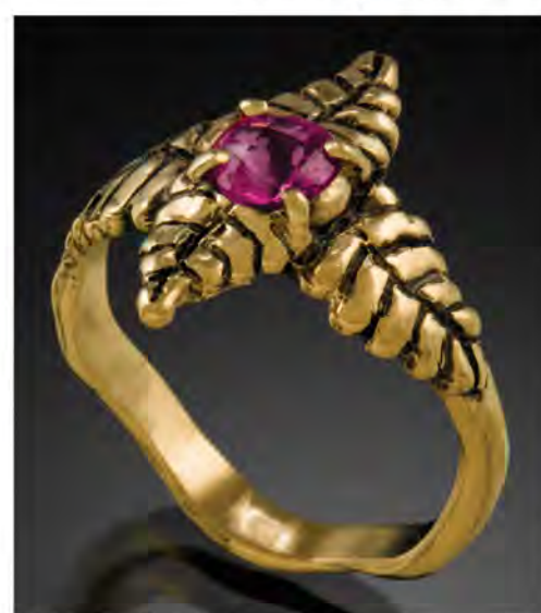
Coleus Leaves with Tourmaline