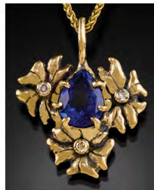
Australian Wildflowers with Sapphire and Diamonds

I hope you can come out to one of my fairs this year to see these new designs and some of my wonderful new gemstones.