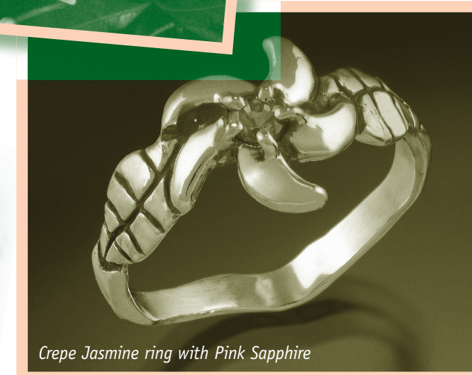
Crepe Jasmine ring with Pink Sapphire