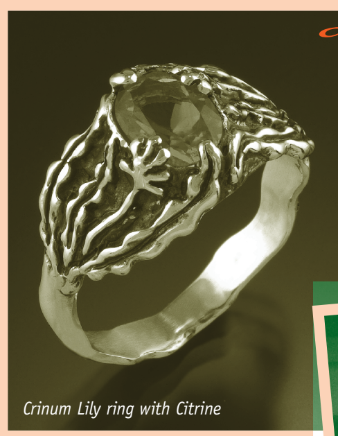
Crinum Lily ring with Citrine

Also known as the Spider lily, has white flowers that are shaped like tubes that flare open into a crown of narrow petals. The clustered flowers with purple stamens are arranged atop thick, succulent stems.