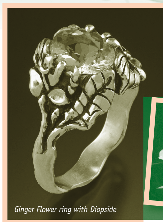
Ginger Flower ring with Diopside

The species was introduced to Hawaii by settlers. The Hawaiians refer to white ginger as "awapuhi", and use the juice of mature seed heads for hair and skin.