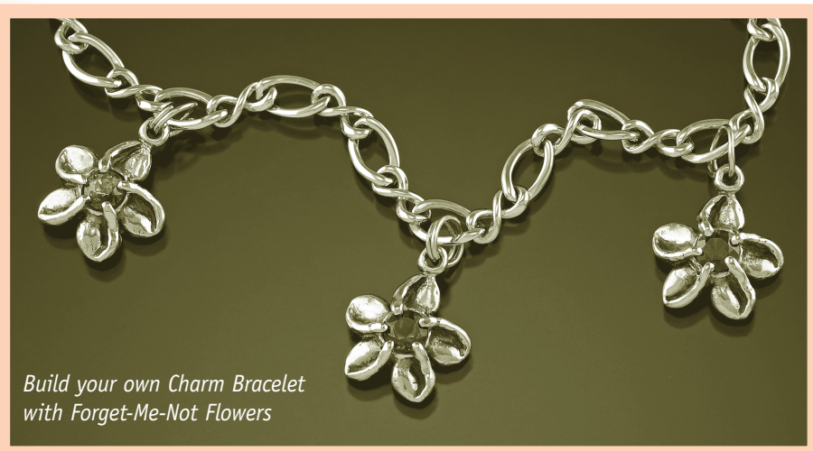
Build your own Charm Bracelet with Forget-Me-Not Flowers

Now with 87 photos of gem rings and more!