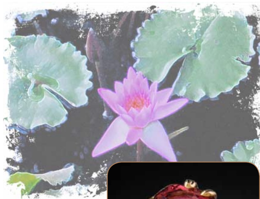
Water Lily & Lily Pads (9x7 mm oval)