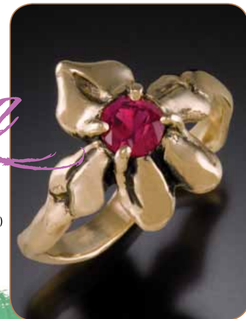
Lao Flower (5mm round)